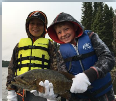
Swan Valley Sport Fishing Enhancement Inc.

This year will be SVSFE's 9 th consecutive Youth Fish Camp. There are two camps hosted in the month of August. The camps are designed to bring a greater appreciation and respect of our resources. Kids aged 9-14 are introduced to fishing basics, boat safety and operation, survival skills, navigation and much more!